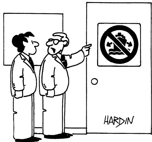
"That's the international symbol for 'Don't Rock The Boat'."